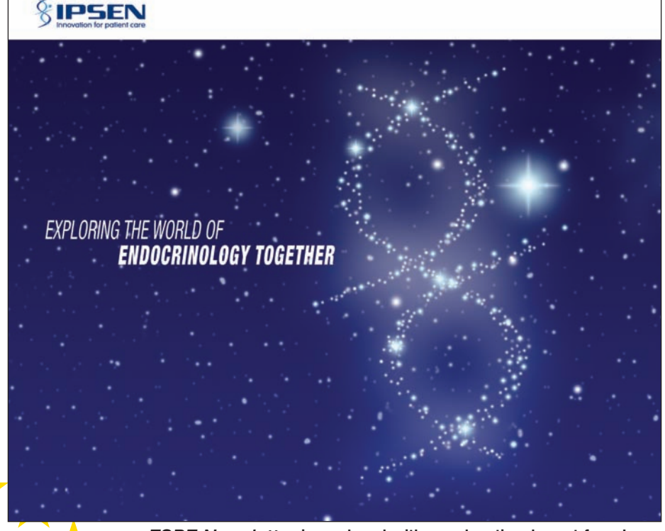
ESPE Newsletter is produced with an educational grant from Ipsen

BioScientifica is a subsidiary of the Society for Endocrinology