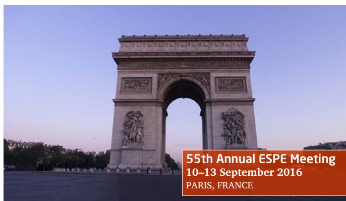
55th Annual ESPE Meeting 10–13 September 2016 PARIS, FRANCE