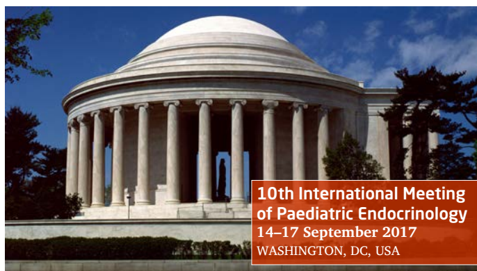
10th International Meeting of Paediatric Endocrinology 14–17 September 2017 WASHINGTON, DC, USA