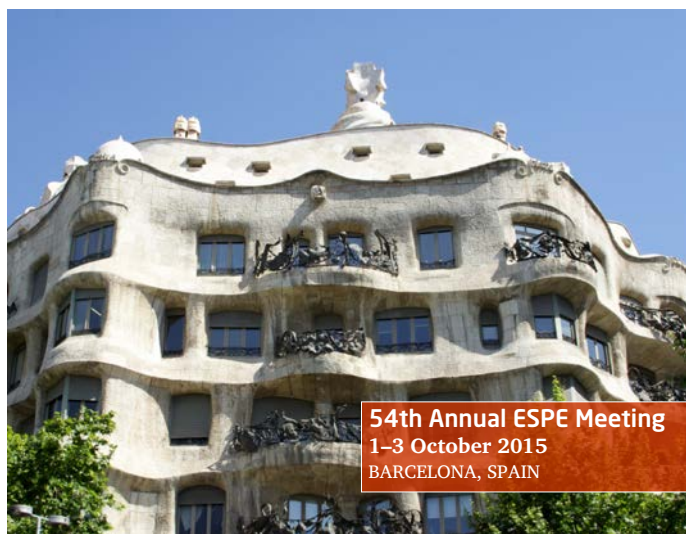
54th Annual ESPE Meeting 1–3 October 2015 BARCELONA, SPAIN

See www.eurospe.org/meetings for details of all future meetings