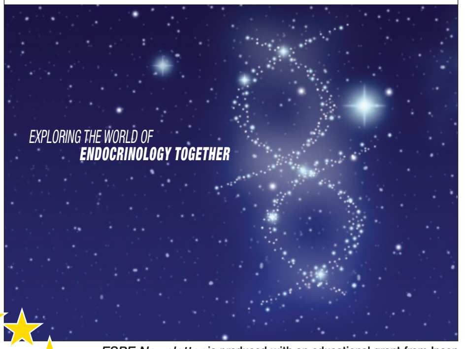
ESPE Newsletter is produced with an educational grant from Ipsen