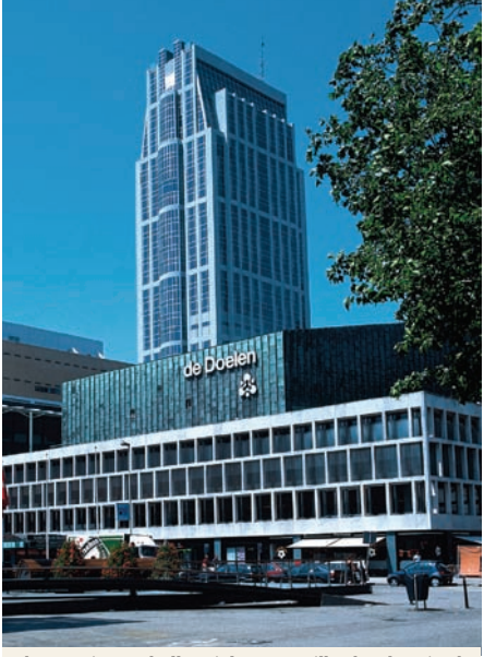
The meeting and all social events will take place in the Congress Centre de Doelen.

I also wish to draw your specific attention to the programme of Friday, June 30th. In the afternoon several working groups will hold very interesting update lectures including the ESPE Working Group on Obesity, the ESPE Working Group on Turner's syndrome, ESPE Bone Club and ESPE EUROGROP, see http://www.espe2006.org for more details. Don't miss the workshop 15:30-17:00h, Diabetes 2006: Global Issues, Global Challenges.